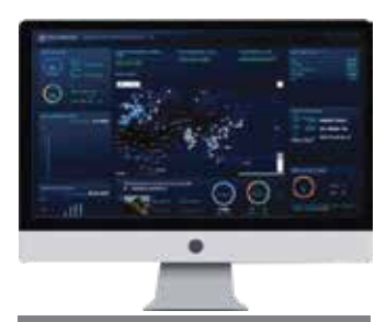
Smart PV Monitoring Platform